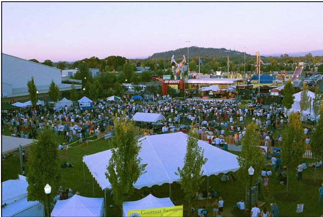
Linn County Fair