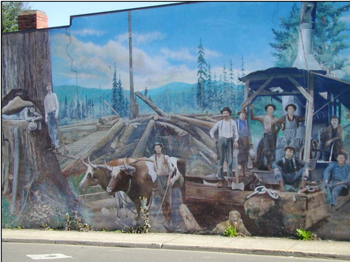
Historic Mural in Sweet Home