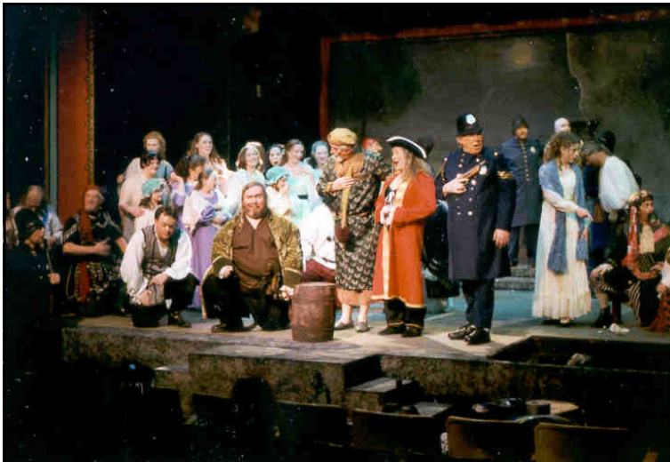
“Pirates of Penzance” at the Albany Civic Theater in Albany