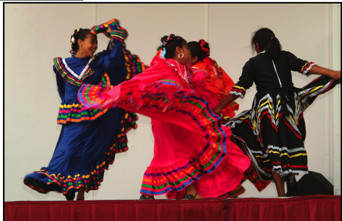
Dancers at the NW Art and Air Festival in Albany