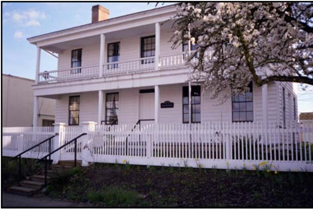
Monteith House in Albany

Linn County forms the heart of the Willamette Valley and stretches from the banks of the Willamette River through the western slopes of the Cascades to the summits of Mount Jefferson and Mount Washington. The rivers of Linn County play a significant role in helping to define the county. The Willamette, North Santiam, South Santiam and Calapooia Rivers dominate the landscape and tie the county together, providing opportunities for commerce and recreation in a beautiful, serene setting teeming with wildlife. When the first pioneers arrived they found an area of rich, fertile ground to establish a strong, thriving agricultural industry which still endures today. Early pioneers also found lush forests on which to build a timber industry that is still one of the driving economic forces in the county. Over time the geographic location, the available transportation linkages, and the access to abundant natural resources led to the development of a strong manufacturing industry which provided a steady source of job growth in the county.