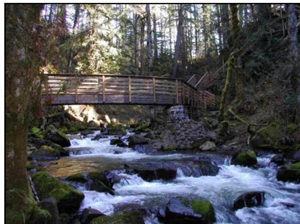
Majestic Falls Bridge in McDowell Creek Falls County Park