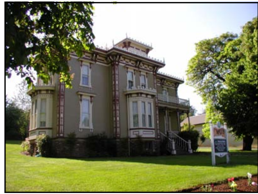
Moyer House in Brownsville

The communities that developed around Linn County's industries and rivers are intensely independent and proud. The majority are still rural in nature. Their heritage is of utmost importance to them, which is evident in the lovingly cared for historic homes, myriad of antique shops, and museums that can be found in almost every city and town in the county. Many of these museums; the Linn County Historical Museum, East Linn Museum, Harrisburg Museum and historic structures like the Monteith House, Rock Hill School, and Boston (Thompson) Mill, not only preserve the heritage of Linn County, but give us a glimpse into the early cultural life of Linn County residents. Early artwork, writings, and fashion can be found right along side the everyday tools and equipment used to build the agricultural life and timber industry of Linn County.