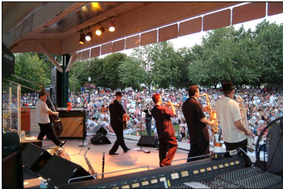
River Rhythms Concert Series in Albany

The by-laws of the Coalition may be amended by an affirmative vote of two-thirds of the members in office at any meeting of the Coalition members, provided that written notice shall have been given to all members at least ten days in advance of the meeting specifying the amendment to be proposed.