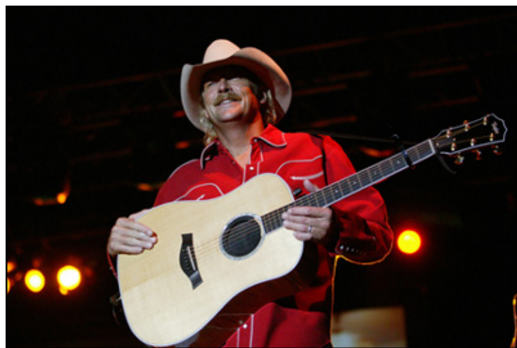
Performer at Oregon Jamboree in Sweet Home