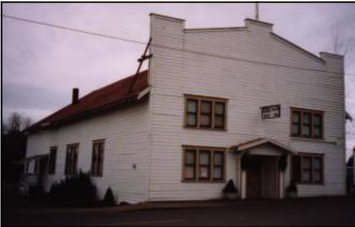
ZCJB Community Hall in Scio