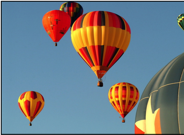
NW Art and Air Festival in Albany

Community festivals and celebrations are also a source of great pride, providing an opportunity for local artists and crafters to display their talents. Events such as the River Rhythms Concert series, The Oregon Jamboree, The NW Art and Air Festival, The Scio Lamb and Wool Fair, The Lebanon Strawberry Festival, The Albany Civic Theater and the Carriage Me Back dramatizations in Brownsville are just a small sample of the many events and organizations which have developed to highlight the cultural life in Linn County.