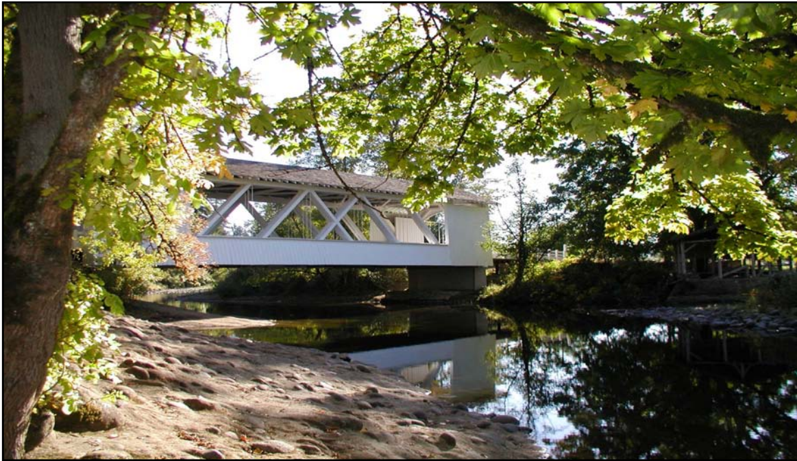
Larwood Covered Bridge in rural Linn County

Through discussions the Linn County Cultural Trust Committee recognized several key problems or issues that the plan would need to address including: the recognition that we have a large diverse county which has little or no system in place to maintain existing cultural resources or encourage creation of new resources. The current economy in Linn County represents a major obstacle to the funding of cultural resources. The benefits of cultural events, activities and facilities need to be promoted on an ongoing basis. There are barriers to accessing cultural activities from both a transportation and economic standpoint.