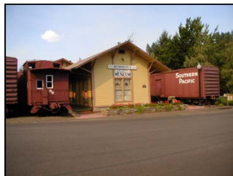
Linn County Historical Museum in Brownsville