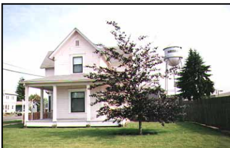
Historic Home in Harrisburg